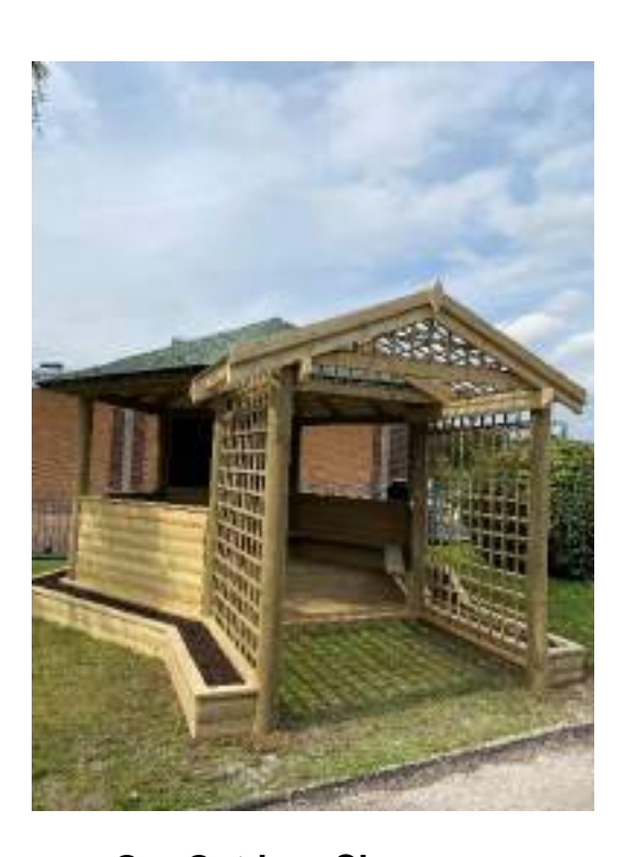
Our Outdoor Classroom