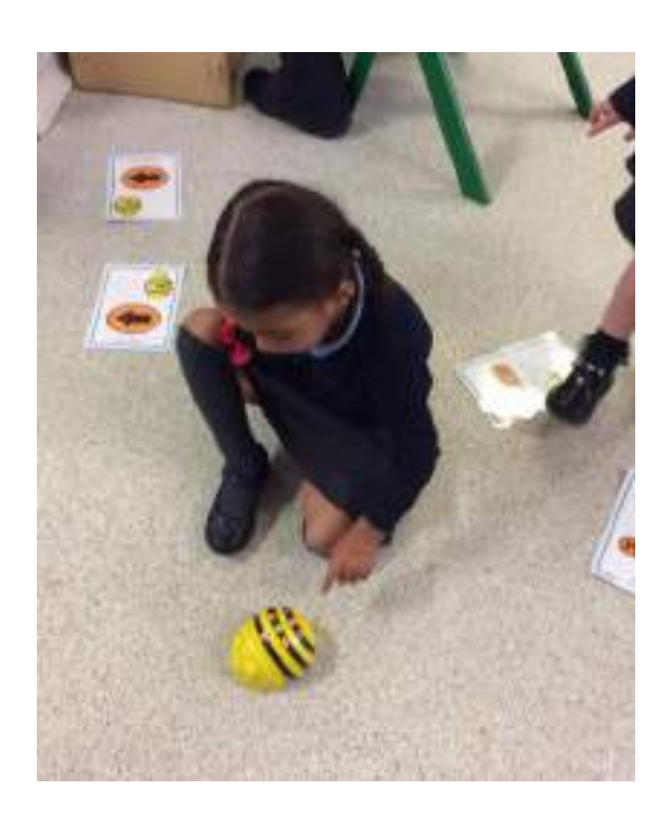
Nursery children using Bee Bops

St Mary's adopt a holistic approach to E-safety, where it is continually taught across the entire school curriculum, information is also regularly provided to parents, to keep our children safe online.