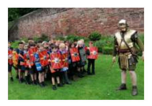
Year 4 - Visit to Dewa

Teachers also seek to enhance the pupils' knowledge and understanding in history with enhancement opportunities outside of the classroom. Some of the class trips and visits which currently take place are: a Y2 trip to Bury fusiliers museum during the study of their WW2 unit and a visit to a local castle, a Y3 trip to a Viking workshop, a Y4 visit to our local war memorial during their WW1 unit and a trip to a Tudor house; and a Y5 visit to Styal Mill during their unit of work on Victorians.