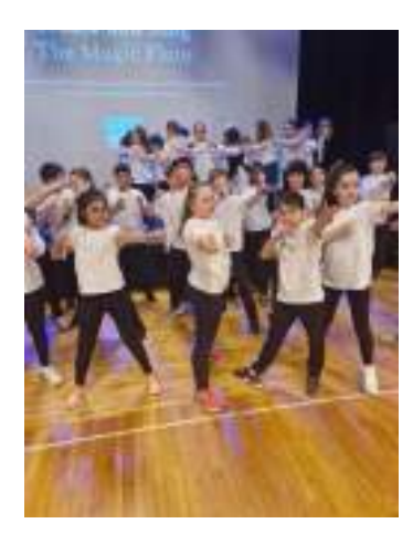
Year 6- Create and Sing The Magic Flute at The Met Bury. Part of the Bury Music Service programme.

The school benefits from visits from peripatetic music teachers (woodwind and string) and we have a good uptake for places. Specialist coaches also teach tennis, football, rugby and basketball. The Y5 and Y6 pupils also have the opportunity to participate in the authority safer cycling scheme. All Year 5 pupils learn the violin.