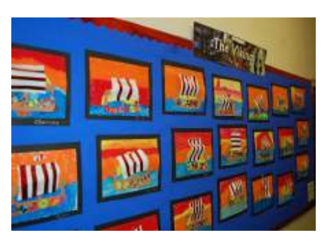
Year 3 - Viking Display

A copy of the school Behaviour Policy and Anti Bullying Policy is available from school on request or on our school website.