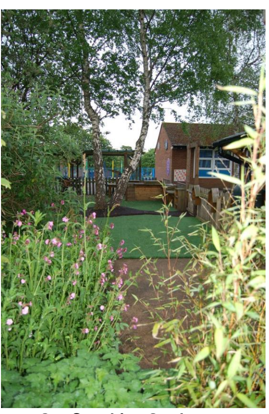
Our Sunshine Garden

As of September 2020, St Mary's now offer a breakfast club facility, operating from 7.30am – 9am during term time, excluding PAD days and Bank Holidays. This is a paid provision. Details can be found on our school website in the Breakfast Club policy and details will be provided in your admissions pack.